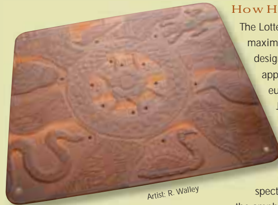
Artist: R. Walley

The elevated walkway and glass arched bridge are together a fusion of sculpture, architecture and engineering. Forged from richly rusted steel, the elevated steel boardwalk is a striking artwork designed to blend into the landscape so the focus is on the surrounding natural and inspiring vistas.