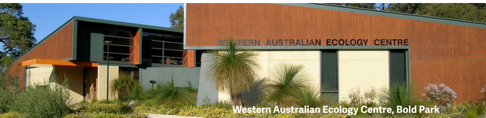
Western Australian Ecology Centre, Bold Park