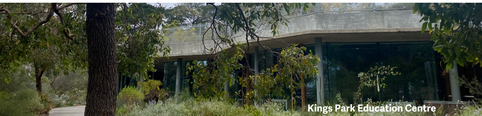
Kings Park Education Centre